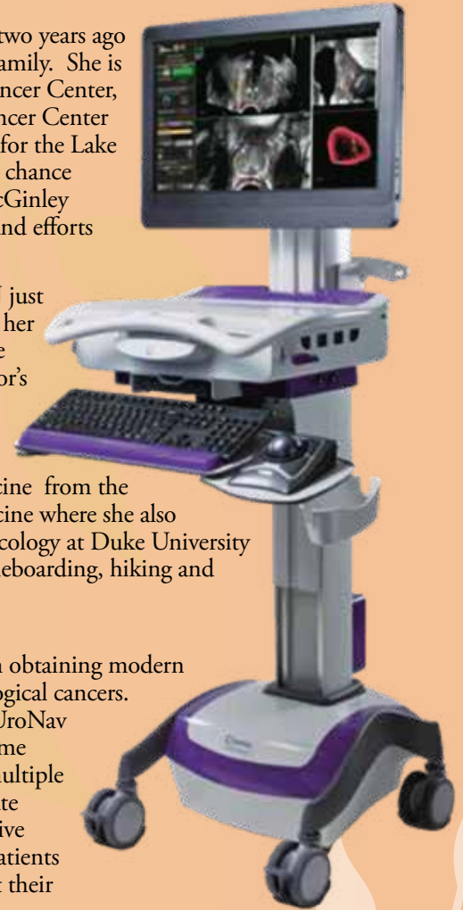
UroNav Fusion Biopsy System