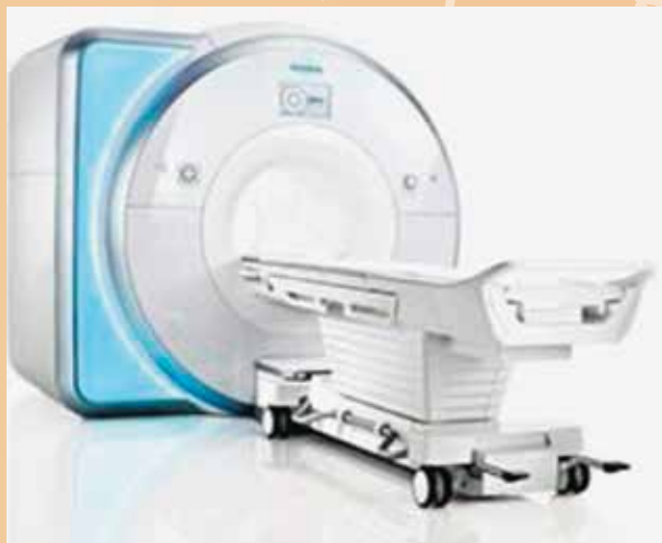
3.0 Tesla MRI