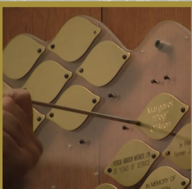
Installing the leaf