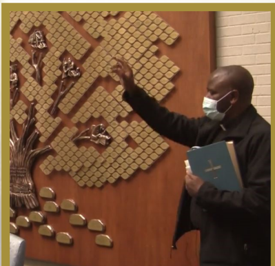
Giving the blessing