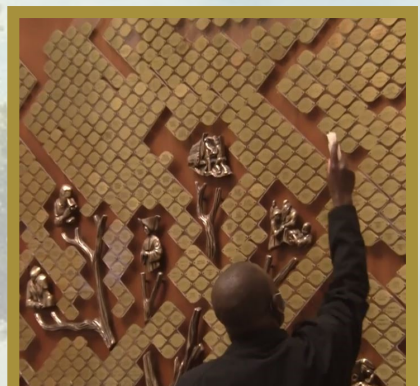
Blessing with holy water